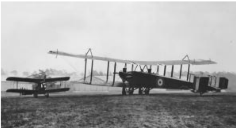
SE5 with Handley Page 0/100 on the right