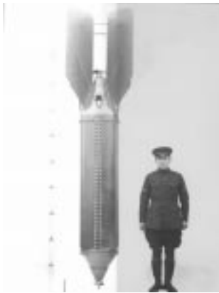
1650 lb bomb 1918

The Independent Force took the war to German cities like Frankfurt, Cologne and Mannheim for the last 5 months of the war. The main targets were the chemical factories (producing poison gas), aeroplane factories, blast furnaces (easy to find) and railways. Operations were carried out both by day and by night against more and more effective air defence forces. Had the war not ended when it did, plans were already made for the big Handley Page V/1500 4-engined bomber, capable of carrying thirty 250 lb bombs, to go into action against Berlin from bases in England.