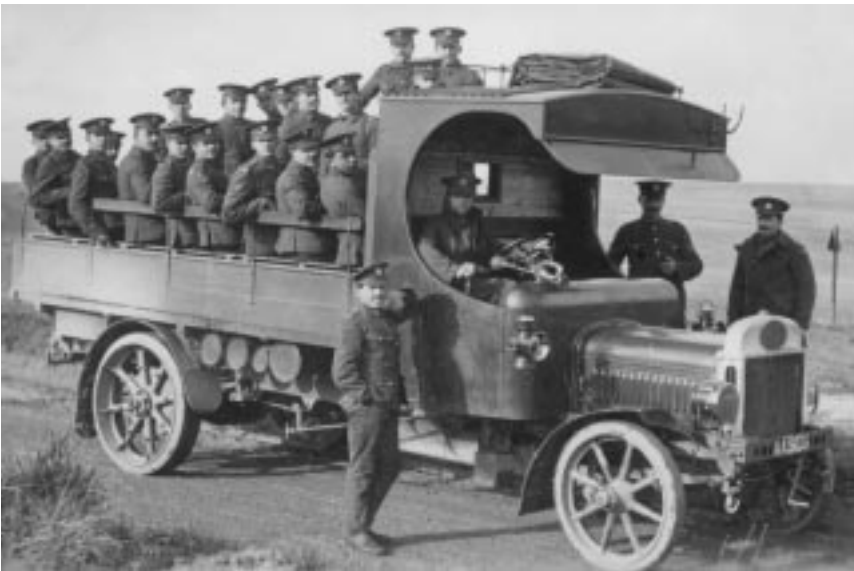
3 Squadron RFC airmen on Leyland transport 1913

Henderson was originally a Sandhurst trained infantry officer in the Argyll and Sutherland Highlanders. In his career he had survived a brush with death in the form of an accidentally discharged bullet during the Zulu war, and had held a number of low-level positions as a staff officer. The situation changed for Henderson after 1911 when, at the age of 49, he enrolled in a flying course with the Bristol Flying School at Brooklands. Under his command and over the next 6 years, Henderson developed some of the central roles that would be carried on by the RAF; aerial reconnaissance, fighter interception and tactical support. Lord Trenchard, when later described as the 'Father of the RAF', would always state that this was not the case; in his opinion, the true Father of the RAF was Lieutenant General Sir David Henderson.