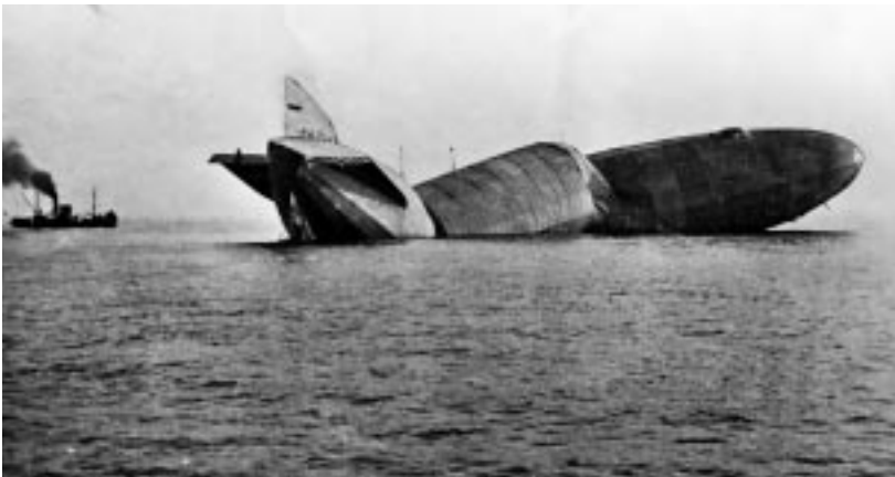
Zeppelin in the sea

The Zeppelins appeared as an invincible armada but they were initially countered successfully by a combination of aircraft, anti-aircraft guns, accidents and luck so that the weaknesses in the British air defence organization were not exposed at the time.