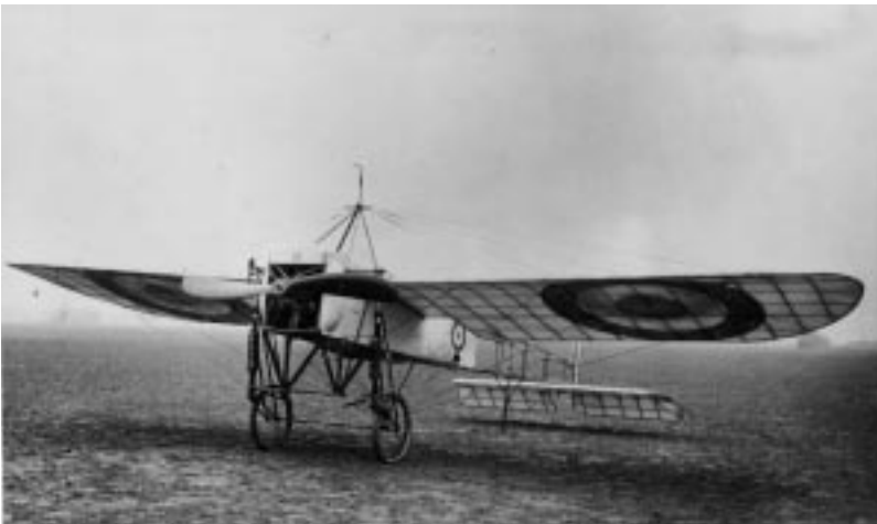
Bleriot XI Monoplane

However, for all the possibilities and in spite of the efforts of enthusiastic individuals, British air power was still a fragile instrument. There was very little equipment and trained aircrew with which to go to war. At the outbreak of the First World War, in August 1914, the Military Wing of the RFC went to France to support the British Expeditionary Force with just 63 aeroplanes, 105 officers and 95 motor transport vehicles. The RNAS remained in Britain to defend vulnerable areas against attack by hostile aircraft.