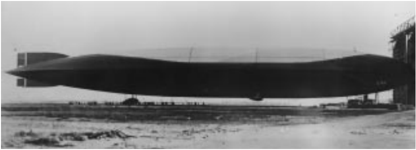
Zeppelin by shed (note the people standing under the aft section)

The Zeppelins appeared as an invincible armada but they were initially countered successfully by a combination of aircraft, anti-aircraft guns, accidents and luck so that the weaknesses in the British air defence organization were not exposed at the time.