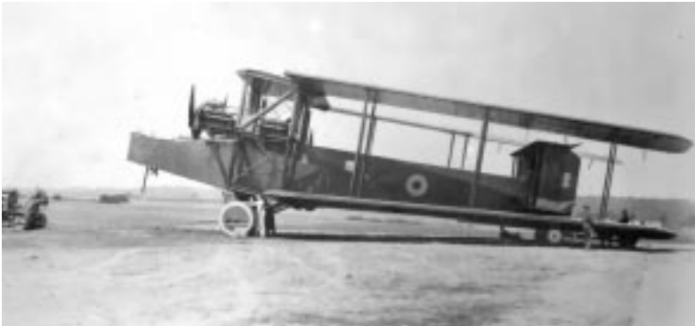
274 Squadron HP V/1500 1918 with folded wings

By 1918, Germany was a war-weary nation that was dispirited by huge losses on the battlefields and was near to starvation from the Allied naval blockade. Consequently, there was some loss of production of war materials from the factories of Germany. But the most significant effect of the raids was that large numbers of German forces were diverted into air defence units to counter the bombers at the time when the German war effort was under its severest strain both at home and on the battlefield.