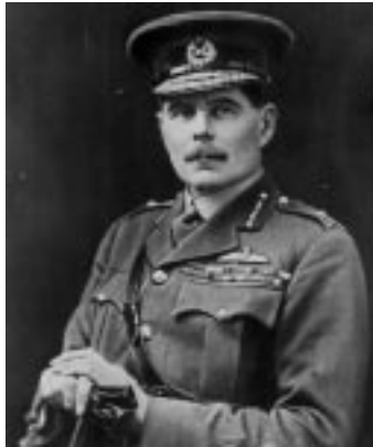
General David Henderson, Major General Hugh Trenchard

Trenchard surprised the War Office by buying up the old Brooklands Flying School and offering rates of pay to aircraft mechanics as high as any Army tradesman. His first major test came when he took command of the RFC facing the Fokker scourge. Trenchard combined a passion for detail with an uncompromising determination to attract the best possible men and machines for the newly formed RFC.