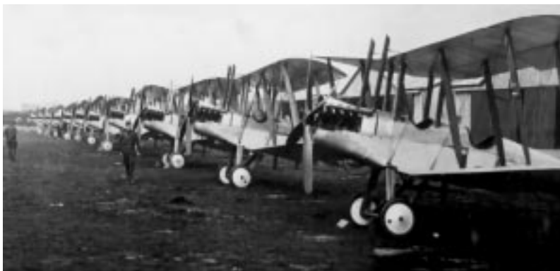
13 Squadron BE2C's at Gosport waiting to go to France 12 October 1915

The German Fokker Eindeckers (monoplanes), fitted with the synchronization gear, took a heavy toll of the slow, almost defenceless BE2s flying reconnaissance missions for the British Army in the winter of 1915-16. The German success was described dramatically in Parliament as “the Fokker scourge”.