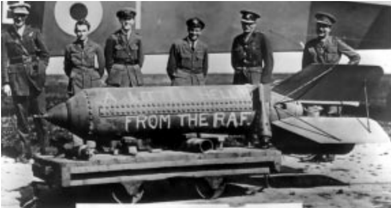
207 Squadron at Ligescourt. Picture shows the largest and smallest bombs in use at that time. August 1918

forecast. The RAF's performance over the Western Front was crucial, both in the part it played in blunting the German offensive and in the final counter-attacks of the Allied Armies which led to the surrender of the German forces in November 1918. The bitterness and scale of air fighting remained undiminished from April until November. For example, RAF Communiqué No 1 records that 57 enemy aircraft were brought down, 37 were driven out of control, 7 lost to anti-aircraft fire while RAF losses were 43; and 85 tons of bombs were dropped, 380,173 rounds fired at ground targets and 3302 photographs were taken.