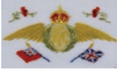
First World War postcard - embroidered RFC wings

On 13 May 1912 the Royal Flying Corps, consisting of separate Naval & Military Wings, was formed. While it was intended that both Wings of the RFC should work in close co-operation, in practice the 2 Wings drifted further and further apart in the period just before the First World War as the differences between them became more and more marked. The Military Wing concentrated on building a reconnaissance force to work closely with the Army and on convincing the Army staff that the aeroplane could get accurate and quick information to the land commander - not an easy task when the cavalry still dominated the War Office. The value of aerial reconnaissance was confirmed in the Army manoeuvres of 1912 and the art of concealment from aerial observation became part of standard Army training from that moment, albeit in a rather primitive fashion at first. It was said that in 1913 an instruction to the infantry went something like: "If you cannot find a hedge, hide yourself under your blanket and make a noise like a mushroom".