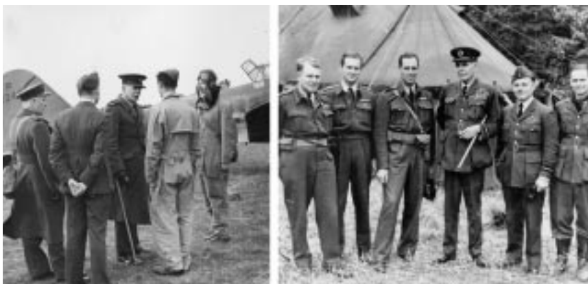
Trenchard with 12 Squadron Battle aircrew France April 1940 (left) and Trenchard visiting officers of the RCAF September 1943 (right)

By 1930, when Trenchard handed over the position of CAS to Air Chief Marshal Sir John Salmond, the main battles for the new Service had been won. Trenchard was to become known as "The Father of the Royal Air Force". Trenchard's special quality was that he could take an idea and put that idea into practice, often beyond the expectations of those who served under him. Above all, he gave the RAF pride and status.