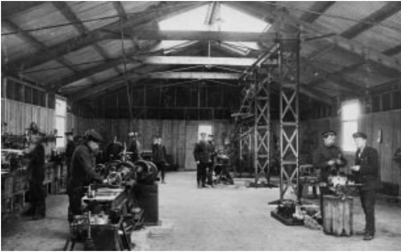
CFS Engine Shop January 1913