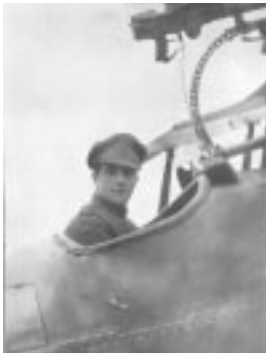
McCudden in his SE5

Consequently, the main task of the fighters became to destroy reconnaissance aircraft and not other fighters. In fact, the role of the reconnaissance pilots and observers has been largely forgotten against the glamour and heroics of the fighter squadrons and the aces such as McCudden, Mannock, Ball, von Richthofen (immortalised as the Red Baron) and Rickenbacker (the first American ace), all enshrined in fact and popular image.