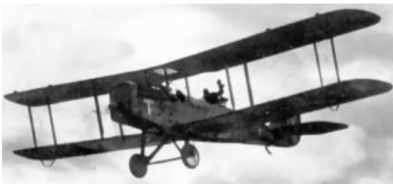
DH4 (above) and DH9 (below)