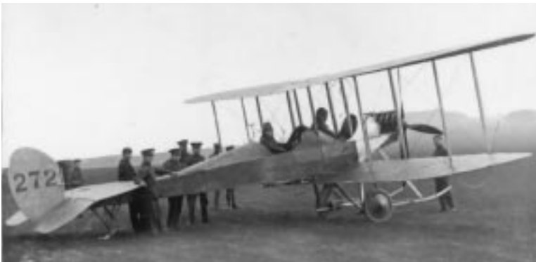
Latest Army Biplane at Larkhill 1913

The War Office changed its official thinking in 1911 by deciding that the old Balloon Section would be expanded into an Air Battalion. With an HQ at Farnborough, with No 1 (Airship) Company also at Farnborough and with No 2 (Aeroplane) Company at Larkhill on Salisbury Plain, Britain now had its first military unit equipped with heavier-than-air craft.