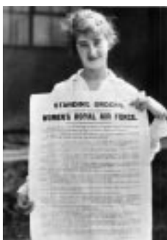
WRAF Standing Orders 1918

In spite of these doubts and reservations, the plans for unification went ahead. Details of pay and discipline were worked out; the words 'Royal Air Force' were heard for the first time; and various legislative procedures brought about an Air Council and an Air Ministry.