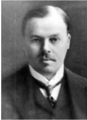
Lord Rothermere - First Secretary of State for the RAF and President of the Air Council