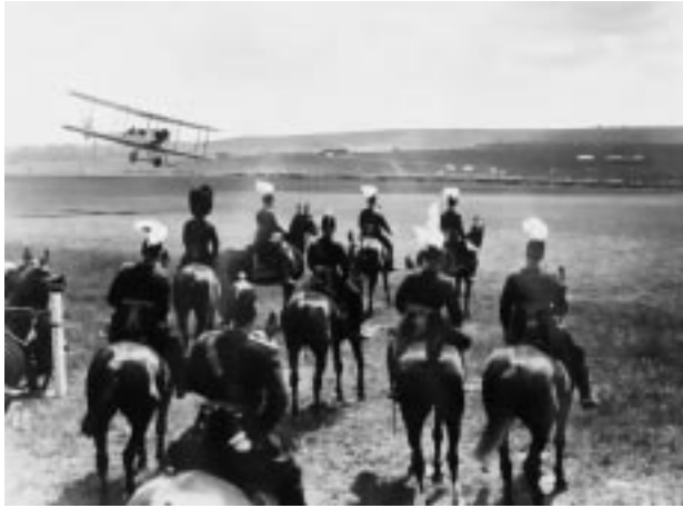
1st Air Review, by General Smith-Dorrien at Perham Down May 1913

The RFC included a military Wing, a Naval Wing, a Central Flying School, a Reserve and the Royal Aircraft Factory at Farnborough (the old Balloon Factory) to provide aircraft for both Wings. The report by Henderson's Committee emphasized that the primary role of all aircraft was reconnaissance and so the new RFC became closely identified with land operations and, to a lesser extent, naval operations in a support role. Possibilities for the wider use of air power, either in air defence against the airship or in retaliatory raids against an aggressor, were not considered.