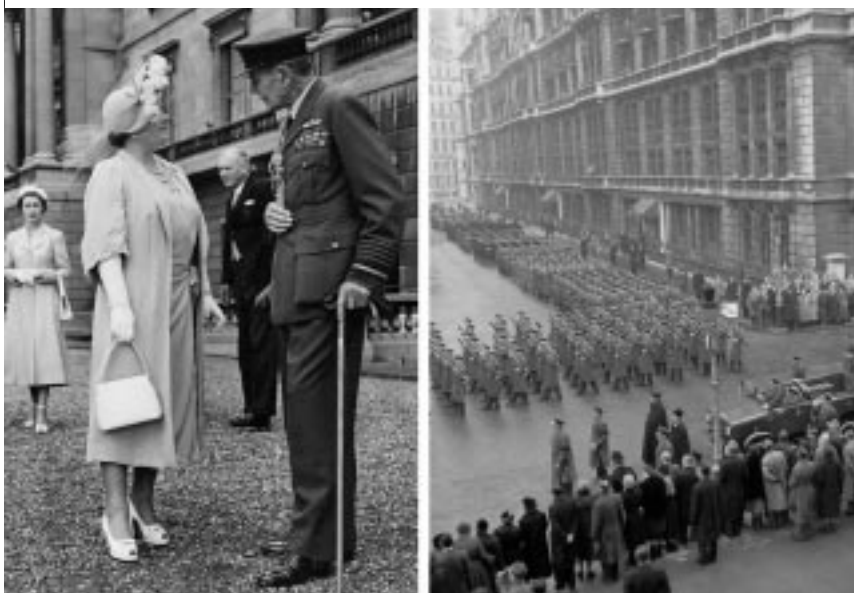
Trenchard with Queen Elizabeth in June 1950 and Trenchard's funeral in 1956

At the age of 57, Trenchard did not retire but was appointed as Commissioner of the Metropolitan Police where, true to his view of the importance of training, he founded the Hendon Police Training College. Viscount Trenchard died in London on 10 February 1956 at the age of 83.