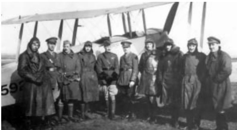
World War One - early RFC pilots

By late 1916, Haig was urgently requesting 20 more squadrons for the Western Front. But that request could not be met without borrowing from the RNAS and it became clear that there was something wrong with both the organization and the supply of equipment and trained personnel for the 2 air services.