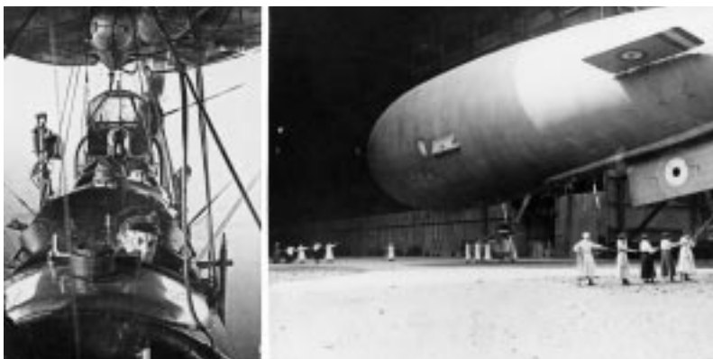
Royal Navy crew in Navy C Series Airship basket, (left) WRAF(WRNAS) Howden Airship Station 1918 (right)

However, the rapid development of airships on the Continent, especially in Germany, prompted the Admiralty to refocus on the importance of airships. As a result, the naval airship section which had been disbanded was resurrected and 2 rigid and 6 non-rigid airships were planned. On 1 January 1914 the Navy assumed control of all airship development.