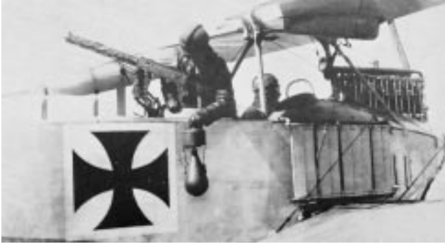
German observer dropping bomb, WWI

The amalgamation of the 2 air services had worked well. Furthermore, the production and supply of aircraft had eventually become so successful that the RAF had enough surplus aircraft to supply American squadrons (in the First World War, the American Air Service never flew an American aeroplane in combat). Complete air superiority had been won over the Western Front and the first strategic bombing force had been seen in action.