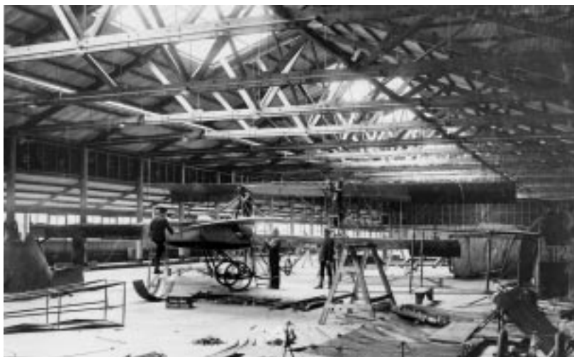
CFS Repair Shop January 1913