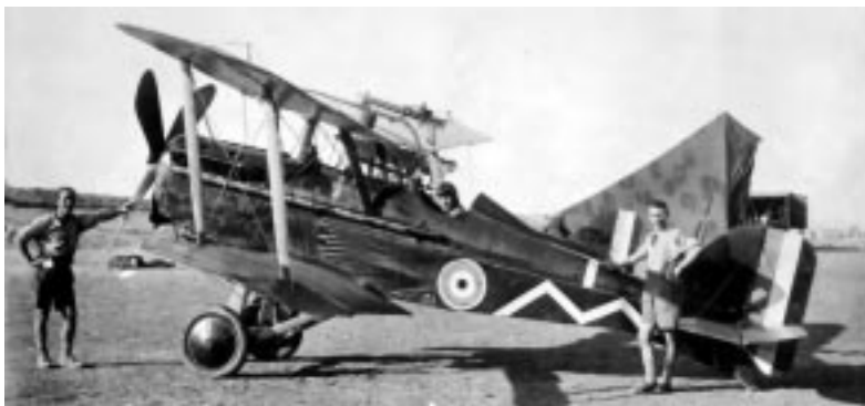
111 Squadron SE5A in the desert

Palestine, Transjordan and Syria and the RAF was instrumental in the rout of Turkish forces in the latter stages of the war. In Mesopotamia (modern day Iraq) the RFC provided reconnaissance to the Indian Army Expeditionary Force and even attempted, unsuccessfully, to re-supply by air the besieged garrison at Kut-Al-Amara. Three RAF squadrons later played a significant role in the offensive to push the Turkish Army out of Mesopotamia. The RAF was to return to this area several times during the Service's subsequent history.