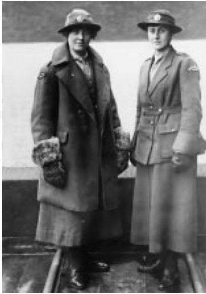
Two women of the RFC

Consequently, the main task of the fighters became to destroy reconnaissance aircraft and not other fighters. In fact, the role of the reconnaissance pilots and observers has been largely forgotten against the glamour and heroics of the fighter squadrons and the aces such as McCudden, Mannock, Ball, von Richthofen (immortalised as the Red Baron) and Rickenbacker (the first American ace), all enshrined in fact and popular image.