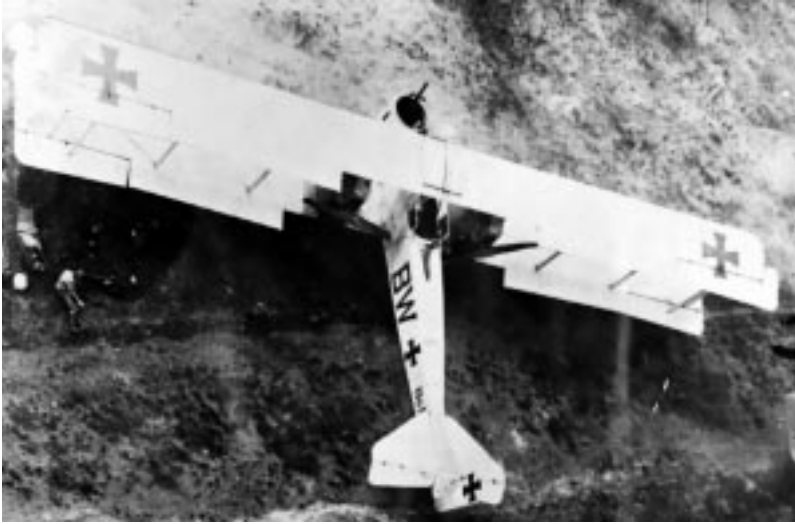
Gotha - Recce Picture

Numerically, the civilian casualties were nothing compared with what was happening, or was still to happen, in the slaughter on the Western Front. But those killed in London were civilians, and the public indignation at such an attack was as vocal as it was predictable. The Times reported that the raid had produced much anger in the public mind, while the Daily Mail, seeking a sensational headline, reported that Britain had not been 'so humiliated since the Dutch Fleet sailed up the Thames in 1667', and called for the resignation of those responsible for such a disgrace. The clamour for reprisals against German cities was as loud in Parliament as it was at Speakers' Corner. "Every time the Germans raid London, British airmen must blot out a German town", Prime Minister Lloyd George was told in the Commons. But the British air services, as the Prime Minister and others knew, were incapable of either effectively stopping the raids, or taking the war to the German homeland.