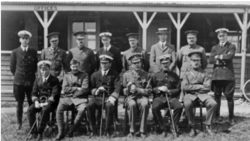
CFS Staff January 1913 (Trenchard front row third from right)

Trenchard surprised the War Office by buying up the old Brooklands Flying School and offering rates of pay to aircraft mechanics as high as any Army tradesman. His first major test came when he took command of the RFC facing the Fokker scourge. Trenchard combined a passion for detail with an uncompromising determination to attract the best possible men and machines for the newly formed RFC.