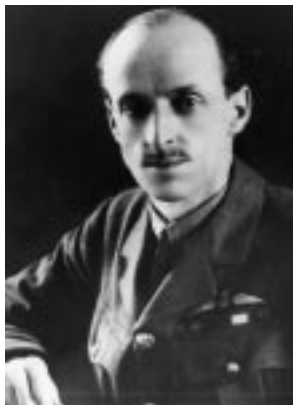
Major General Sir Fredrick Sykes