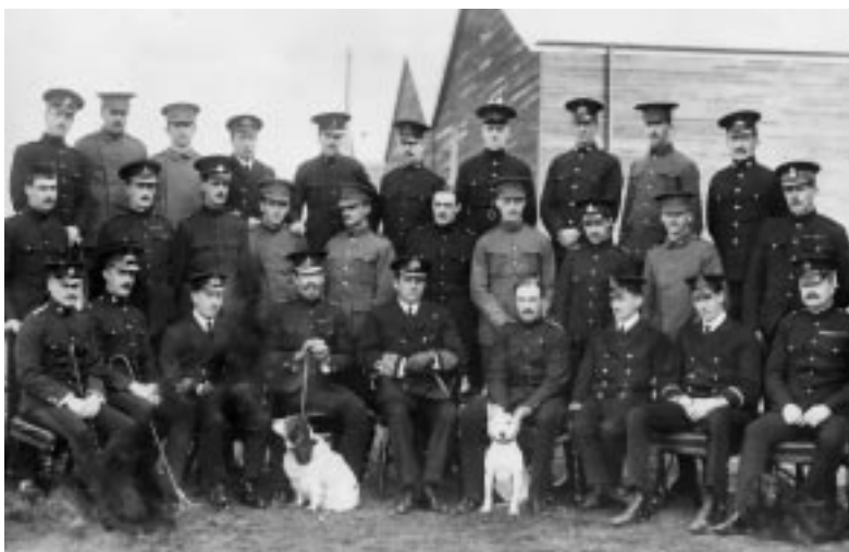
First CFS Course 17 August-19 December 1912