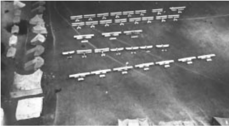
Netheravon Camp June 1914

The amalgamation of the 2 air services had worked well. Furthermore, the production and supply of aircraft had eventually become so successful that the RAF had enough surplus aircraft to supply American squadrons (in the First World War, the American Air Service never flew an American aeroplane in combat). Complete air superiority had been won over the Western Front and the first strategic bombing force had been seen in action.