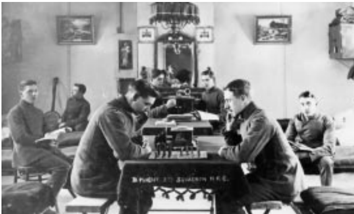
B Flight 13 Squadron RFC 1913

On 13 May 1912 the Royal Flying Corps, consisting of separate Naval & Military Wings, was formed. While it was intended that both Wings of the RFC should work in close co-operation, in practice the 2 Wings drifted further and further apart in the period just before the First World War as the differences between them became more and more marked. The Military Wing concentrated on building a reconnaissance force to work closely with the Army and on convincing the Army staff that the aeroplane could get accurate and quick information to the land commander - not an easy task when the cavalry still dominated the War Office. The value of aerial reconnaissance was confirmed in the Army manoeuvres of 1912 and the art of concealment from aerial observation became part of standard Army training from that moment, albeit in a rather primitive fashion at first. It was said that in 1913 an instruction to the infantry went something like: "If you cannot find a hedge, hide yourself under your blanket and make a noise like a mushroom".