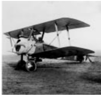
Halberstadt (left) forced down by OC 35 Squadron and Sopwith Camel (right) with bombs 16 December 1917