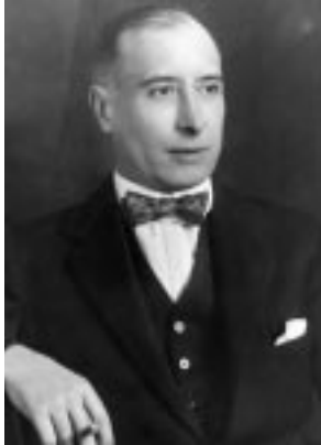
Lord Weir Secretary of State for Air, April 1918-January 1919

Major-General Sir Frederick Sykes, who had been Chief Staff Officer of the RFC when it went to France in 1914, became the next CAS. Finally, before April was through, Rothermere himself resigned and was replaced by the Scottish industrialist, Sir William Weir.