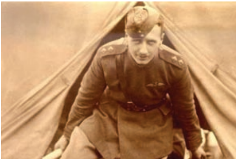
Lieutenant Leefe Robinson VC

However, the weaknesses in the British air defence were soon exposed by the daylight raids of the German Gothas, and later Giants, in 1917. In the first daylight raid on 13 June 1917, 162 people were killed and 432 injured - in one fell swoop the complacency of government and public alike was shattered. Seventy-two tons of bombs fell within a one-mile radius of Liverpool Street Station, others at Fenchurch Street and in the east end of London. The aircraft of both the RFC and the RNAS that took off to defend London were barely able to get within striking distance of the bombers which could either outfly or outclimb them. When the Gothas returned on 7 July, the defenders made better contact, but only one Gotha was destroyed while the civilian casualty list was 57 killed and 193 injured.