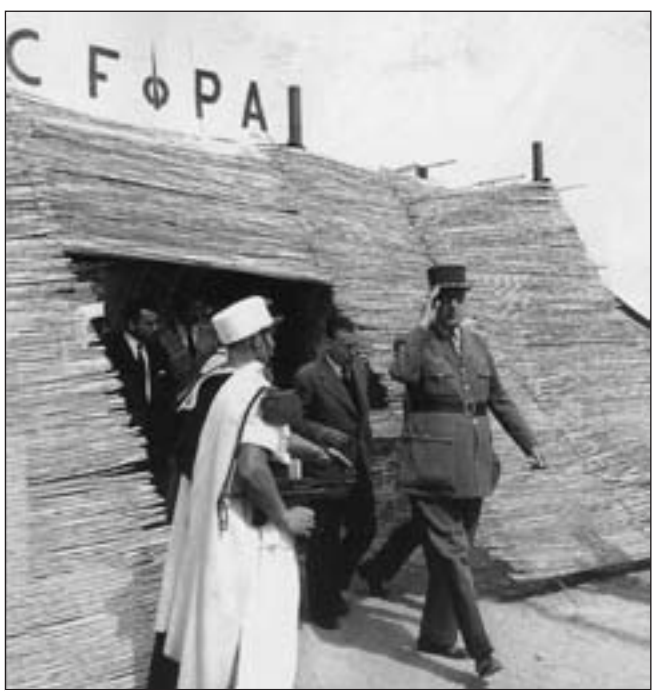
General Charles De Gaulle in Algeria.