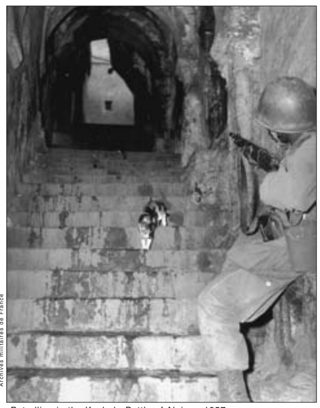
Patrolling in the Kasbah, Battle of Algiers, 1957

the battle was being fought in order to keep Algeria within France. This certainty was then reaffirmed in the unequivocal themes of a proposal by the 10<sup>th</sup> Region Headquarters to the Regional Office: "France will remain in Algeria; Algeria will remain French; the government will not negotiate with the rebels; the declaration of intent of the Council's Chair (January 1957) will be applied."<sup>21</sup>