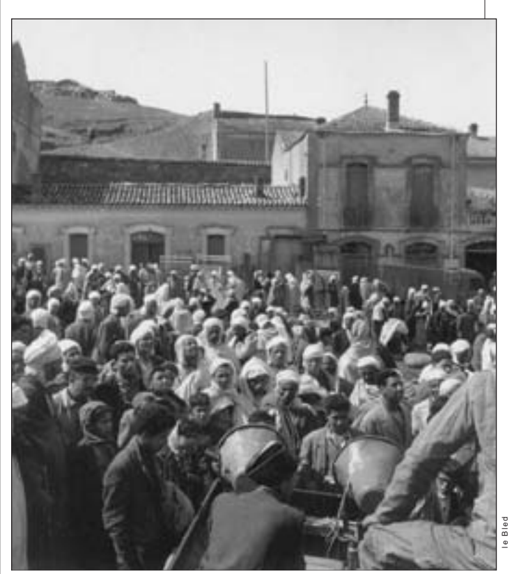
The loudspeakers of a mobile CHPT unit in action, circa 1957.

During the central period between January 1957 and August 1958, revolutionary warfare experienced a series of resounding successes, and it became an enabler in the emancipation and the political engagement of the army, whose increasing power in the face of a weakening regime led it to search for a rationale for its initial mission, namely, to keep Algeria within France.