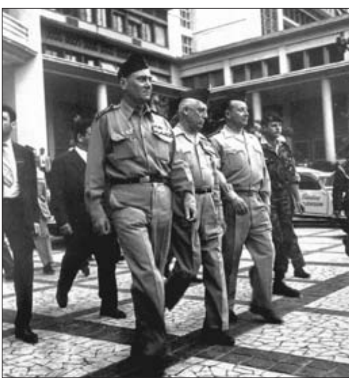
Archives militaires de Frai