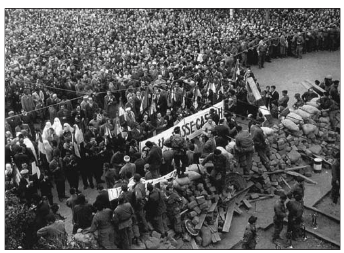
The barricades in Algiers, 25-27 January 1960.