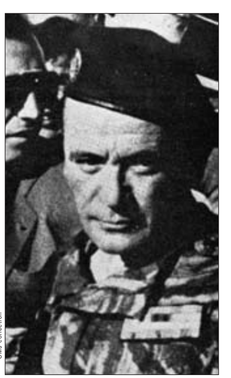
Colonel Yves Godard

following excerpt from an article published in France's Armed Forces Journal: