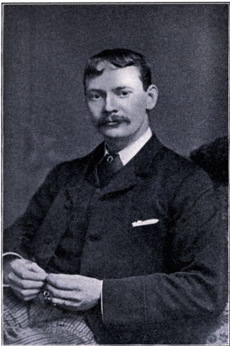
JEROME K. JEROME