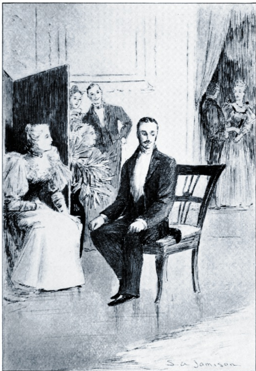
HIS TORTURES ARE THE SPORT OF THE DRAWING ROOM ARENA