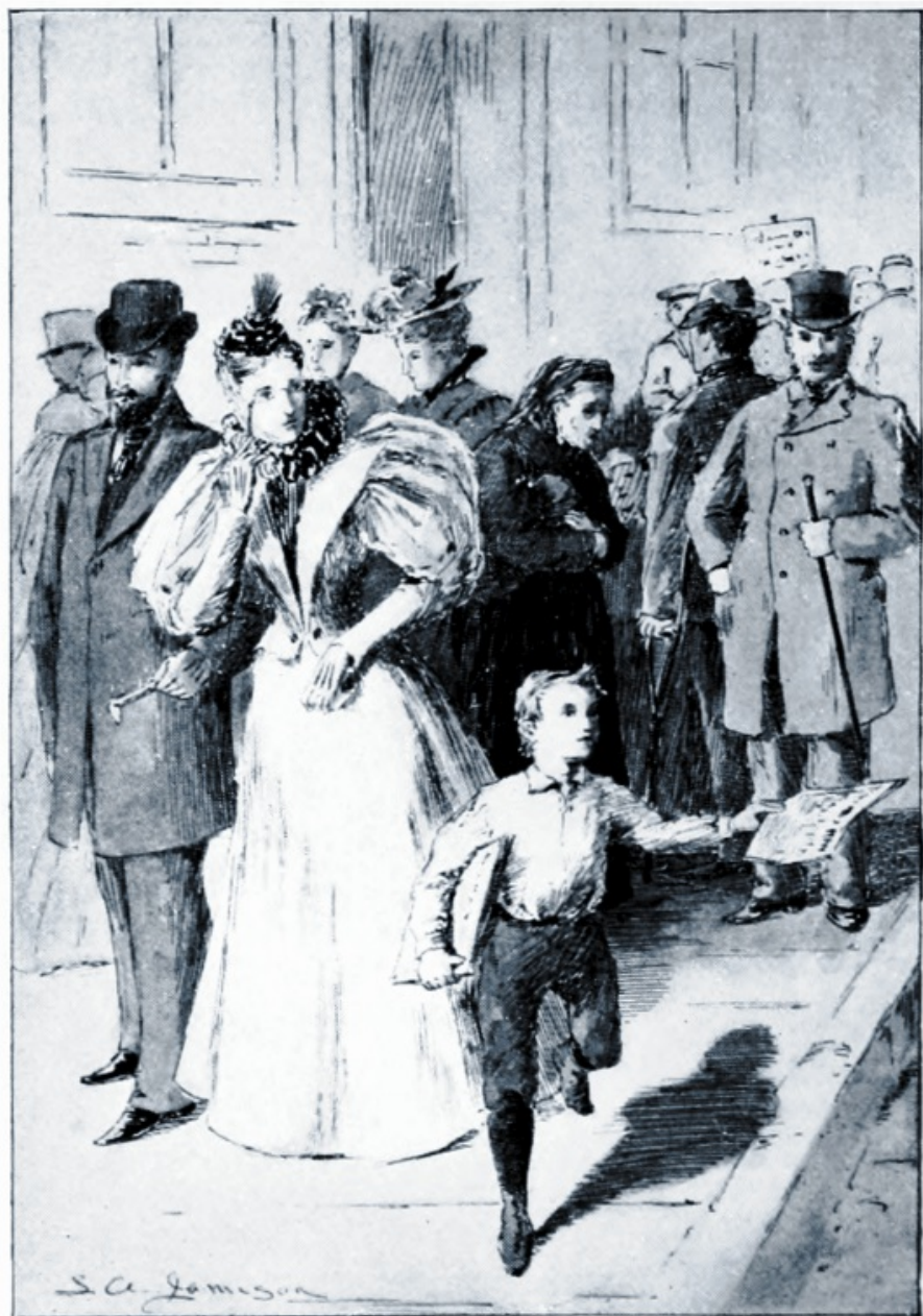
MARK THEM AS THEY SURGE ALONG