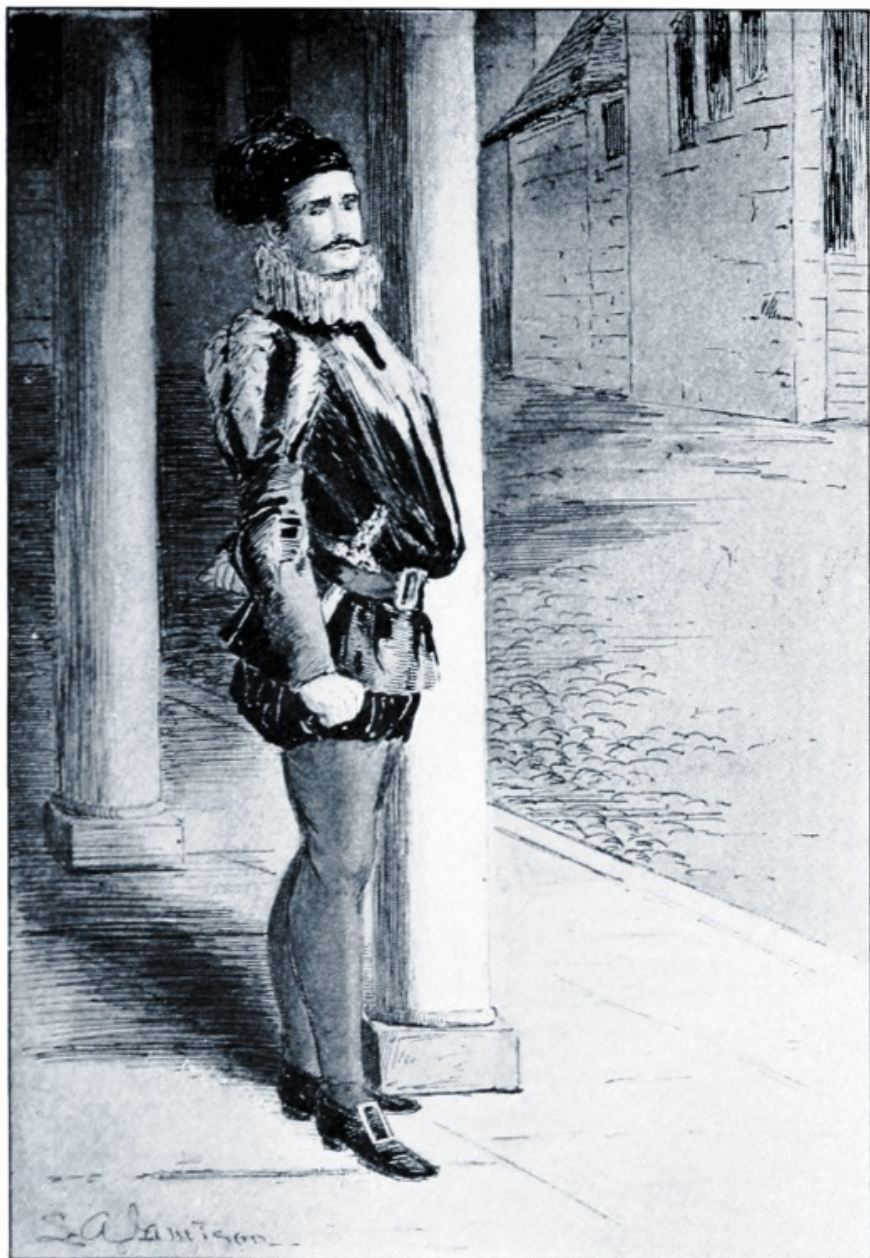
COULD NOT HELP BEING FIERCE WITH A PLUME IN HIS BONNET, A DAGGER IN HIS BELT