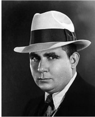
Robert Ervin Howard

And some return by the failing light And some in the waking dream, For she hears the heels of the dripping ghosts That ride the rough roofbeam. —Kipling