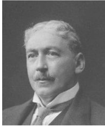
H. de Vere Stacpoole

THE OTHER DAY in London the Southern Star, one of the largest and certainly the most beautiful of the world's diamonds, was put up for auction and "failed to realize any price." I forget what the bidding went to, nor does the amount matter beyond the statement that it was absurdly small.