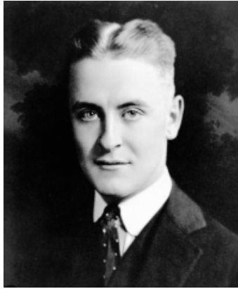
Francis Scott Key Fitzgerald

"AND WHERE'S Mr. Campbell?" Charlie asked.