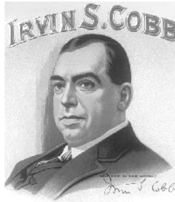
Irvin Shrewsbury Cobb

The Saturday Evening Post , 24 March 1917