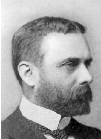
Sir Horatio Gilbert Parker, 1862-1932