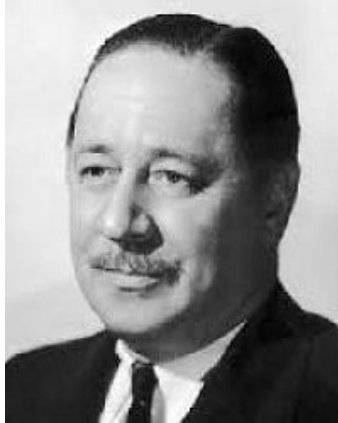
Charles Robert Benchley

First published in 1930. Collected in Robert Benchley Beside Himself , 1943